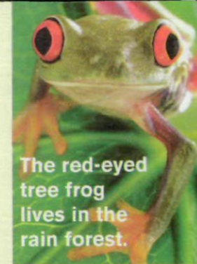
The red-eyed tree frog lives in the rain forest.

The World Wildlife Fund is a group working to protect animals and habitats . A habitat is a place in nature where an animal or a plant lives. "We are working every day to help save rain forests around the world," says Zobor.